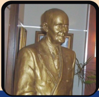
PAUL HARRIS FOUNDER THE ROTARY ORG